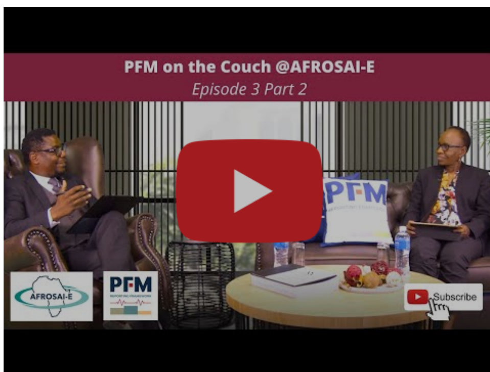
PFM on the Couch @AFROSAI-E Episode 3 Part 2